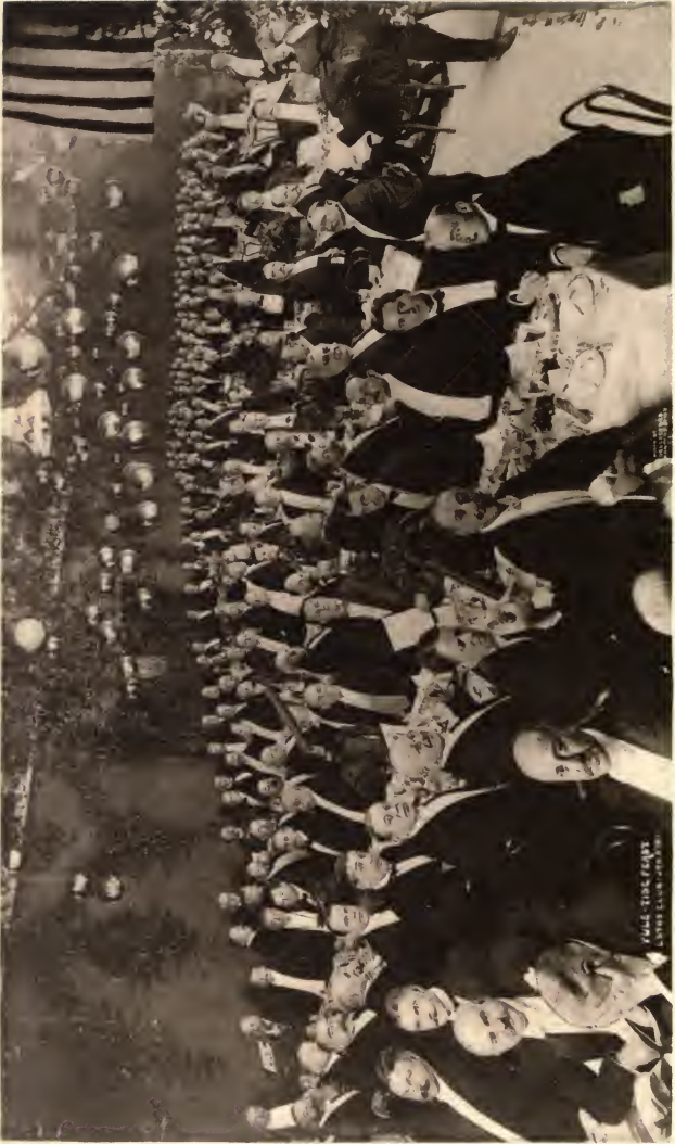
1904. THE CAUCUS AT THE CONVENTION